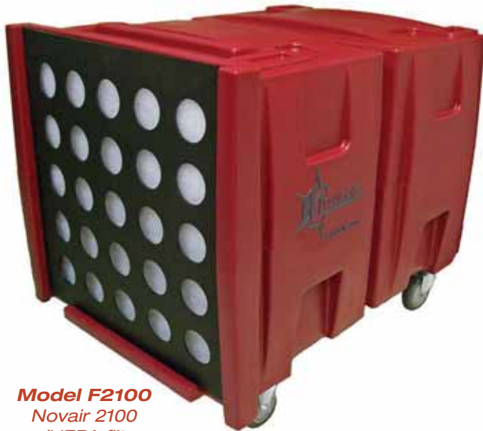
Model F2100 Novair 2100 w/HEPA filter