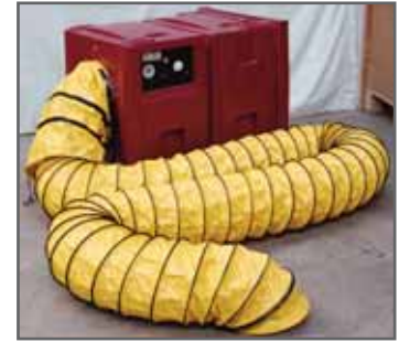
Novair 2000 can be used as a portable, self-con- tained duct system with optional ducting