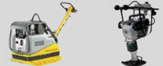
PLATE TAMPERS, ROLLERS, UPRIGHTS & REVERSIBLES